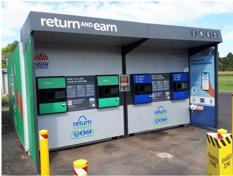
The upgraded Return and Earn machine positioned in the car park of the Uralla Bowling Club

The Uralla Return and Earn machine located at Uralla Bowlo, 19 Queen Street, Uralla has been upgraded to double its capacity, with two additional chutes added for returning eligible bottles, cans and cartons.