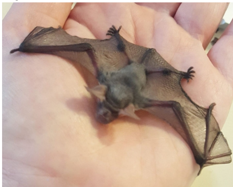
Flora stretching her wings, approximately 3 weeks old.