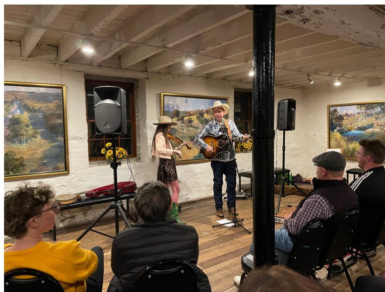
The Whitetop Mountaineers in full stride at McCrossin's Mill