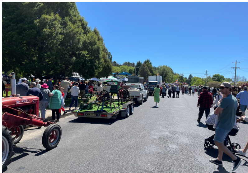
Thunderbolt's Festival saw a large crowd in Alma Park last Saturday

email HNELHD-FarmgateSupport@health.nsw.gov.au