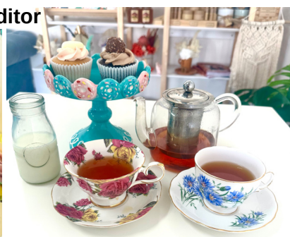
Some of the enticing treats from the Cupcake Shop including the popular unicorn cupcakes (left).