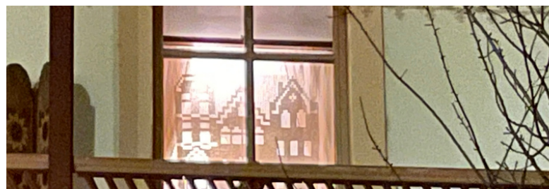
Somewhere in Uralla.