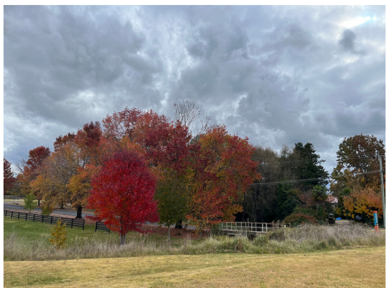
Rejoice, Nearly the End of Autumn.

Please email all contributions including advertising, letters to the editor, 100 Words, and articles to urallawordsworth@gmail.com