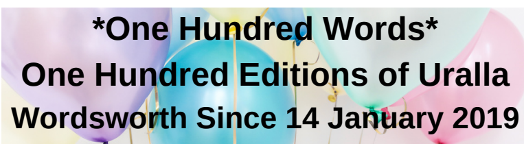
We reached a significant milestone