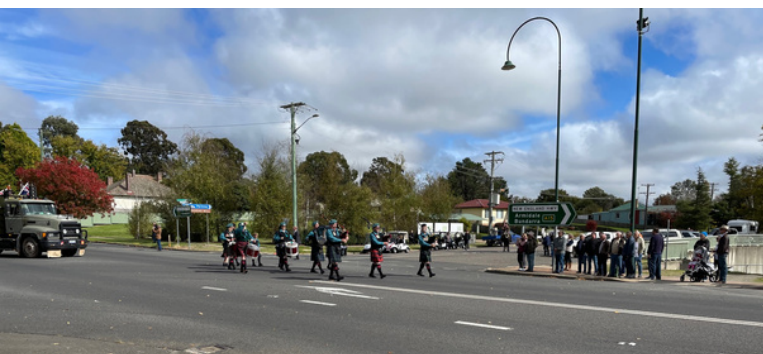
The marching band of Uralla residents heading the ANZAC Day parade