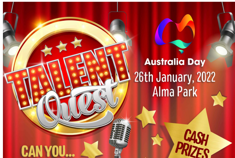
Australia Day celebrations Keith Potger Australia Day Ambassador for Uralla