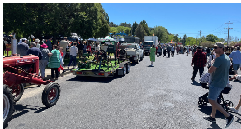
Thunderbolt's Festival attracted a large crowd in Alma Park