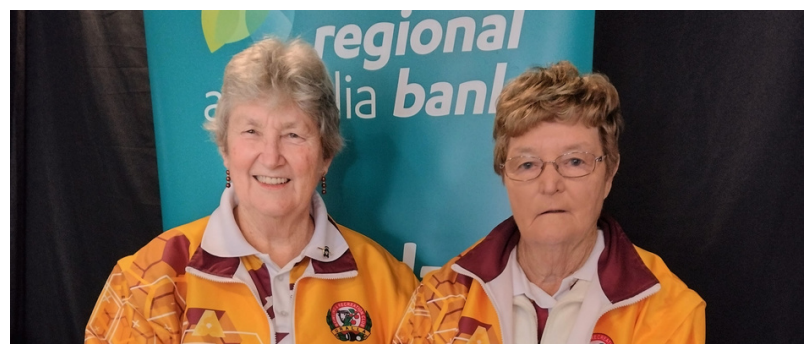
Uralla Women's Bowling Club were one of many recipients of RAB's Community Partnership support