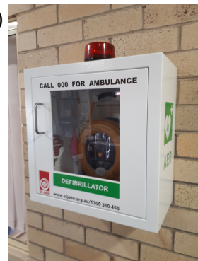
Defibrillator at McMaugh Gardens.

Identify defibrillators closest to your home or work and make a note of the hours in which they are accessible.