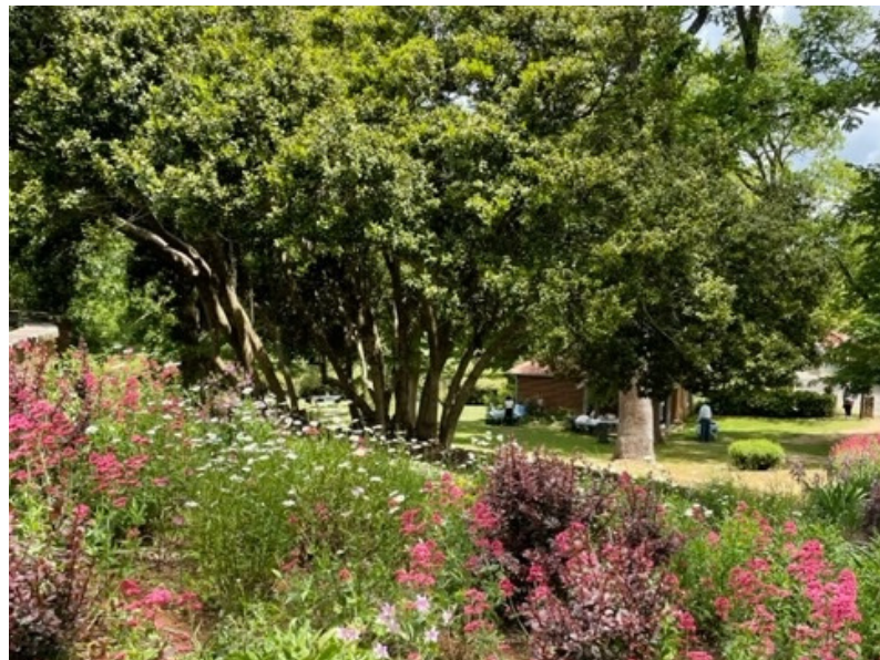
The terraced garden.