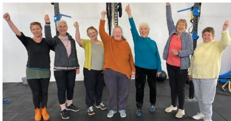
The Pulse Fitness over 65s fitness program was supported by Uralla Grants

"We've been extremely happy with the range and number of community focused projects that received our