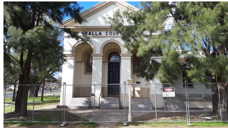
Uralla Court House under refurbishment