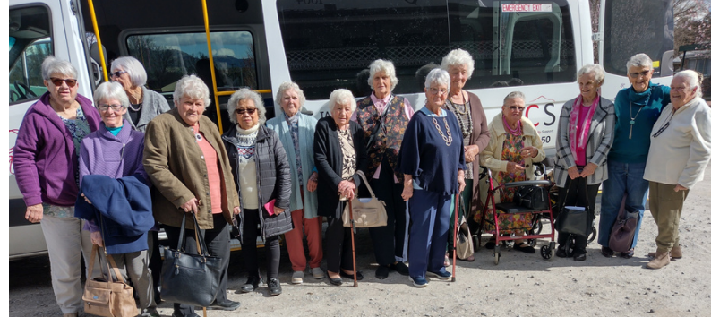
Seniors and Pensioners in front of the Bendemeer Hotel