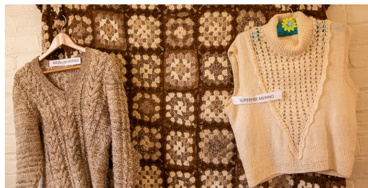
Some of the craft items on display