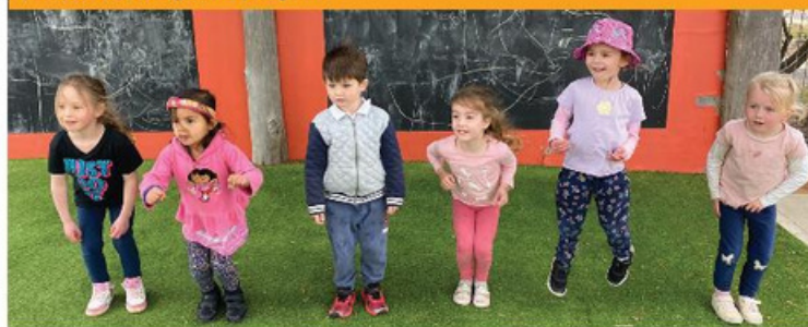
Uralla Preschool installed new harmony bells, funded by the grants program

Apply now at www.newenglandsolar.com.au/urallagrants