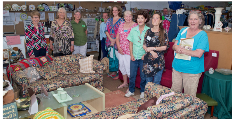
Her Excellency Margaret Beazley (left), volunteers and customers