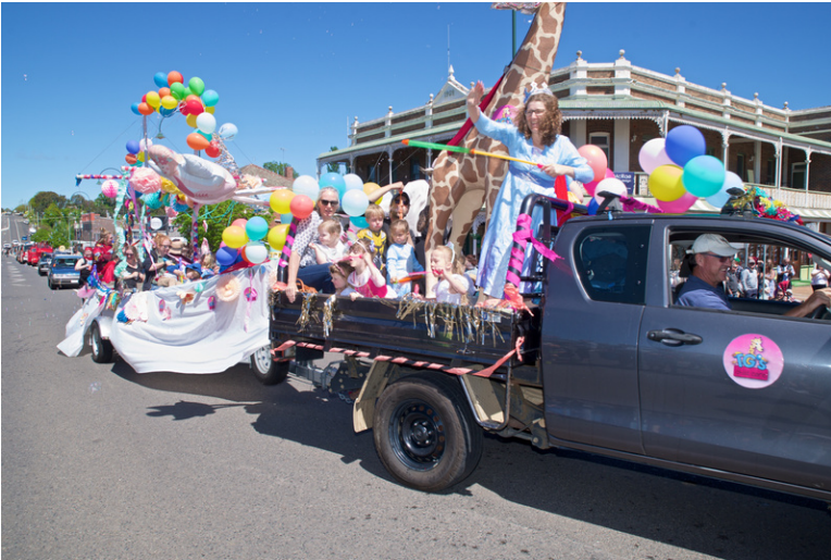
Thunderbolt's Festival street parade

Thunderbolt's Festival was held Saturday 29 Oct in our lovely Alma Park and how lucky we had a sunny day in between all the rainy weather! The park was a little swampy in patches but the market stalls managed to set up and the inflatable slide, giant jumping castle and rock climb wall - all found some high ground. From set up to finish there was a stack of kids utilising the free activities and a small line up waiting for their turn. Such a busy day and so amazingly wonderful to all be together, just having fun and celebrating life in Uralla.