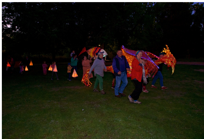
Thunderbolt's Festival, the lantern parade