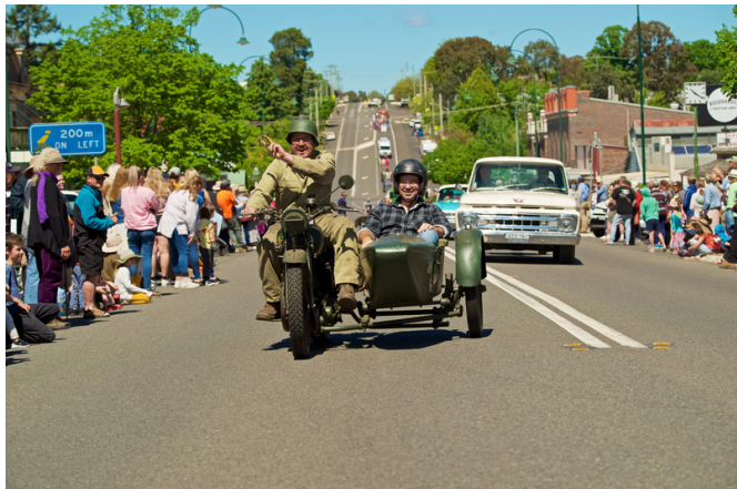
Thunderbolt's Festival street parade