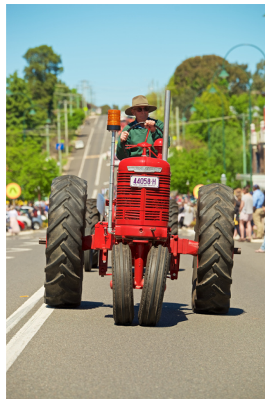
Vintage machinery, Thunderbolt's Festival