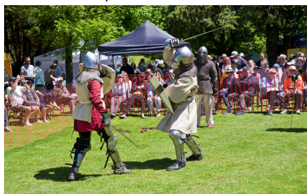
Thunderbolt's Festival, Medieval Arts Display