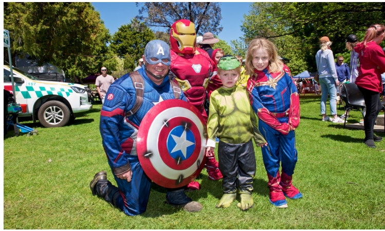
Thunderbolt's Festival. Superheroes were out in strength