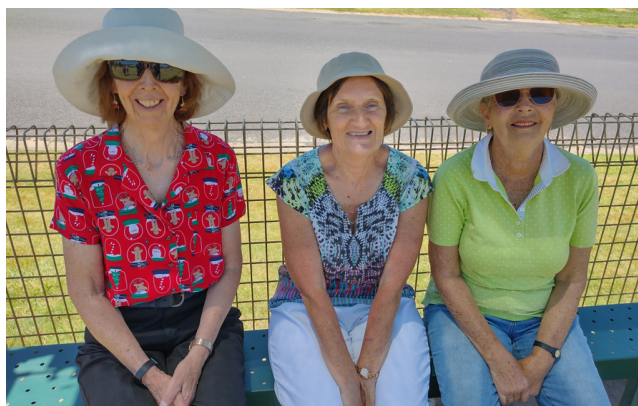
Taking a rest during Uralla's Can Assist Bowls Day