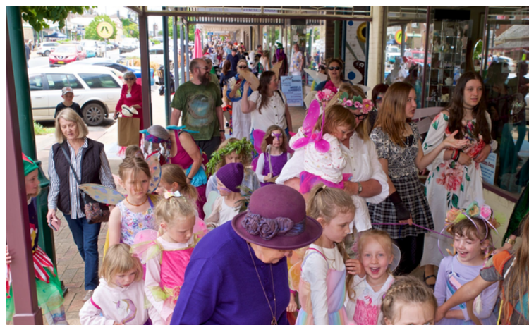
Below: Fairies as far as the eye can see during the Fairy Festival Parade.