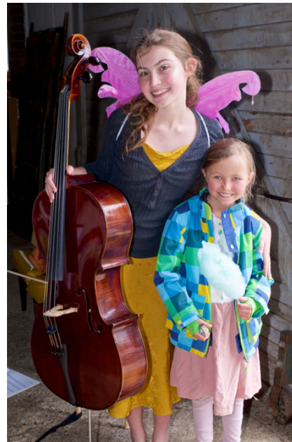
Left: One very talented fairy cellists drew lots of attention at the Fairy Festival including this newly found friend.