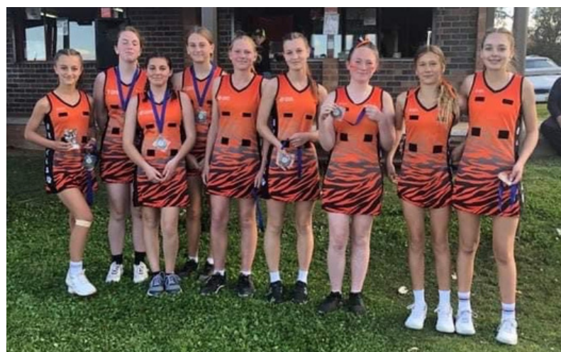
Uralla Jaguars' netball team, winners of the Local Junior Team of the Year at the 2AD/FM 100.3 Sport Star of the Year Awards

Uralla Netball Club is so proud of the girls' achievements.