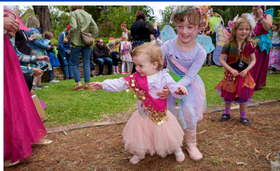
Fairy fun in the fairy garden at the Fairy Festival

Northern Tablelands Wildlife Carers.... 1800 008 290