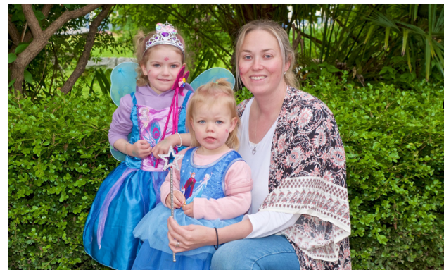
More fairies in the fairy garden. Uralla Fairy Festival

*Free event. Uralla Shire Library, Watercolour Xmas Card Workshop. At the library on Saturday 17 December 2 to 4pm plus a second session on Wednesday 21 December from 3:30 to 5pm to complete your cards. Call 0267786470 to reserve your spot.