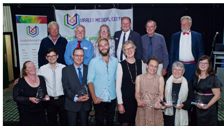
2021 Chamber Award, partners and winners