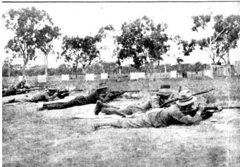
The Sun 16.10.1924: A snapshot showing part of the Avenue of trees in the background.