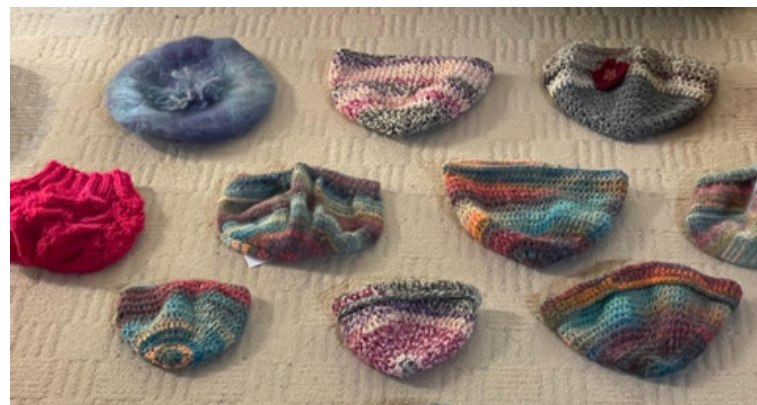
Some of the donated beanies!

New England Solar Renewable Energy from ACEN